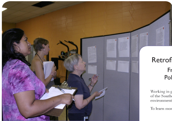
Community leaders came together to discuss stories the youth collected, share their own stories, and help identify themes.

Toolkit partners in South Chicago used the Guide's curation techniques as part of their work creating a community-wide exhibit. The exhibit highlights stories collected by local youth about residents' green practices and promotes the community's vision for a green future. It includes nine displays and two outdoor planters, located at sites throughout the Southeast Side. The Field Museum worked with project partners to help them identify story themes and then develop a unifying identity for the exhibit. Learn more: climatechicago.fieldmuseum.org/south-chicago