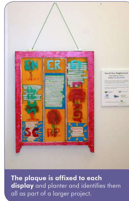
The plaque is affixed to each display and planter and identifies them all as part of a larger project.

The project team developed a unifying identity for the exhibit, by creating an exhibit title and tagline featured on this plaque.